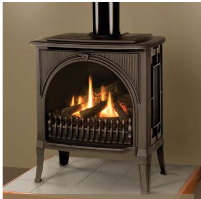
Also available in Majolica Brown Enamel (as seen on front page)

ABOUT OUR EFFICIENCY RATINGS At Valor we use recognized Canadian and US government test methods for determining energy efficiency performance. This ensures our products will perform in your home as rated. Beware of misleading "steady state" efficien claims made by manufacturers using their own "in-house" test methods. For more information visit our website at valorfireplaces.com.